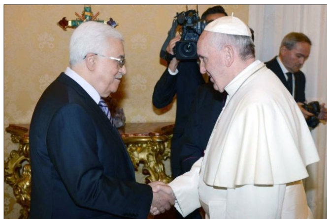
Pope Francis (right) and PA president Mahmoud Abbas at the Vatican, May 2015. The Comprehensive Agreement between the Palestinian Authority and the Vatican was a major political boon for the PA. The agreement included criticism of Israel's actions in Jerusalem and the West Bank.

The preamble to the short 2000 agreement with the PLO referred to the inalienable right of the Palestinian people to achieve self-determination under international law, emphasized the need for a just peace, and called on all sides to avoid unilateral actions that alter the status of Jerusalem (along with a veiled reference to the city's internationalization). But the actual articles of the agreement with the PA focused on religious rights and freedoms, the international human right to freedom of