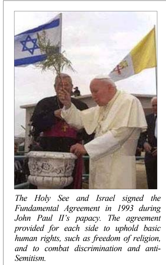
The Holy See and Israel signed the Fundamental Agreement in 1993 during John Paul II's papacy. The agreement provided for each side to uphold basic human rights, such as freedom of religion, and to combat discrimination and anti-Semitism.

The Six-Day War of June 1967, in which Israel captured Jerusalem and the West Bank, marked the next significant milestone for the Holy See. During the war, Pope Paul VI pressured Israel to declare Jerusalem an open city under international control, but Israel had already celebrated what it termed the city's reunification. 25 However, Israel immediately provided legal protection for free worship and access to sanctuaries, promised to safeguard the holy sites, 26 and offered to establish official