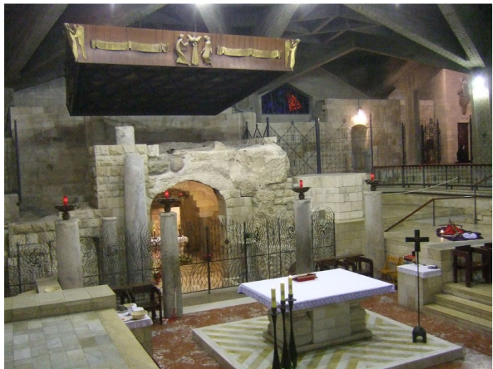
The Basilica of the Annunciation, Nazareth. The Vatican seems to want to wrest Christian holy sites from the control of Muslim and Jewish governing authorities with a view toward internationalization.

Significantly enough, the agreement was publicly released—in sharp contrast to the Holy See’s general abstention from releasing its agreements with Arab states. This could be because of the Vatican’s desire to ensure proper protection for key holy sites and Catholic laity during a difficult time, or because of its wish to prod Israel into further engagement given the years-long stalemate in the peace process. The 2015 agreement is long and comprehensive; availing its text to the public can serve as a potential impetus (and possible blueprint) for Holy See-Israeli negotiations.