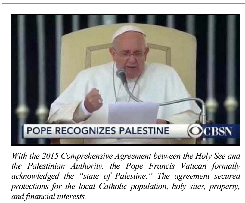
With the 2015 Comprehensive Agreement between the Holy See and the Palestinian Authority, the Pope Francis Vatican formally acknowledged the “state of Palestine.” The agreement secured protections for the local Catholic population, holy sites, property, and financial interests.

The agreement establishes both the standing 2 and mode of interaction 3 between the Catholic Church and the PA (and by extension, Israel), and describes the church’s interests in the Holy Land. 4 In exchange for the Vatican’s formal recognition, 5 the PA agreed to provide a broad gamut of religious benefits, 6 not only for security for the local Catholic population to pursue its religious